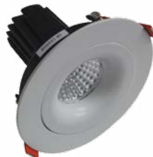
MDL 503 LED