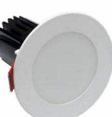
MDL 801 IP44