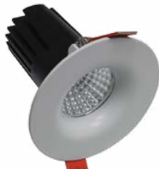
MDL 501 LED IP44