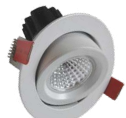
MDL 703 IP44