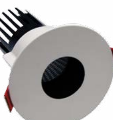
MDL 901 IP44