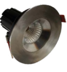
MDL 601 IP44