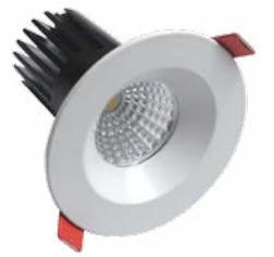
MDL 601 IP44