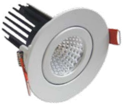
MDL 403 - iSpot