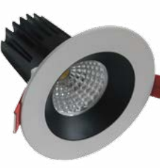
MDL 601 IP44